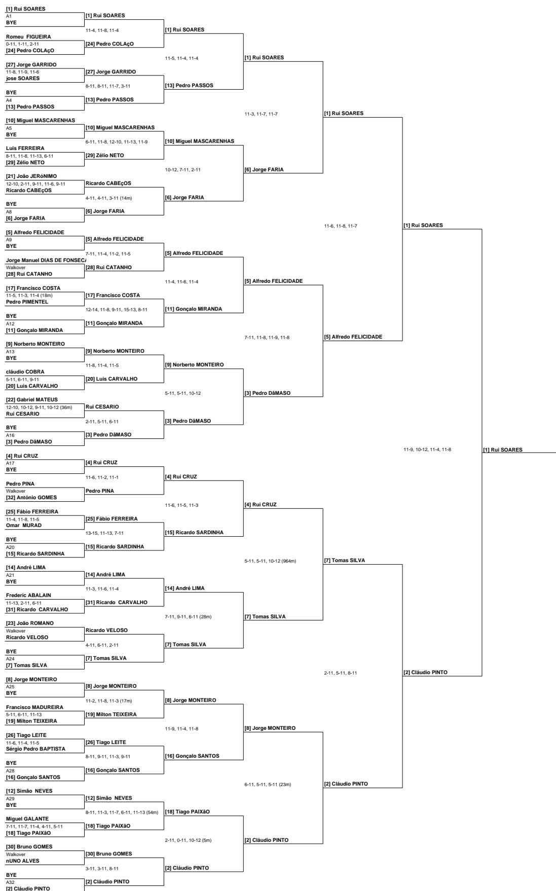
PSA National Closed Draw